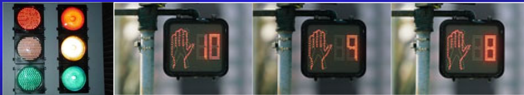
LED light installations, Pedestrian Countdown Timers