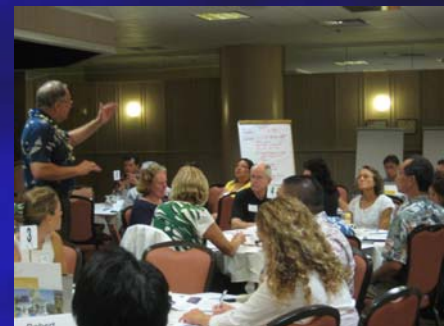
Pedestrian Safety Action Plan workshops 2008

Continue to build new partnerships and foster existing relationships to improve the transportation system for all roadway users.